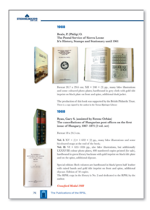
Example page of the literature catalogue showing the layout.